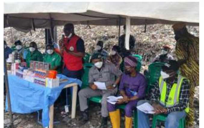
Pic - Oyo zone Refresher training Pic 7,8,9- Destruction of fake and substandard products seized at Idumota drug market