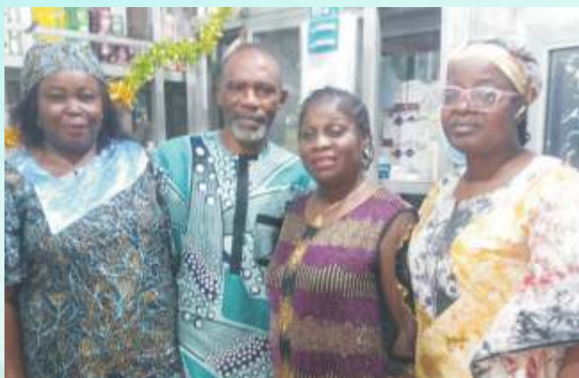
Visit to fire accident victims premises