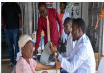
MEDICAL OUTREACH TO MARK 2024 WORLD PHARMACIST DAY IN AKURE