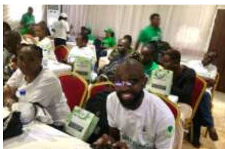
ACPN Rivers State Delegates at the NAFDAC Training and launch of NAFDAC Greenbook and Scan2Verify App in Port Harcourt, Rivers State. March 13th 2025