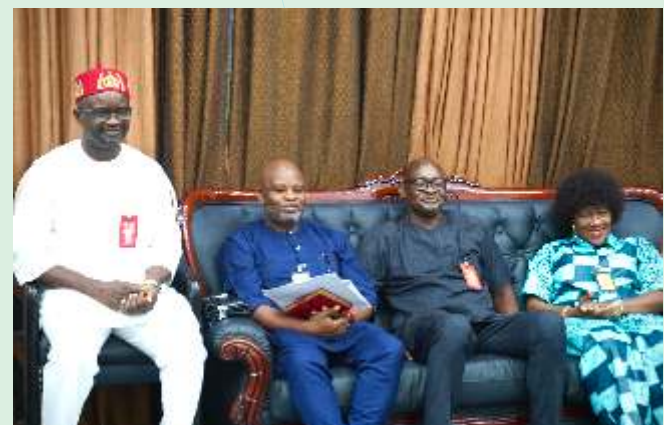
ADVOCACY VISIT TO ANAMBRA STATE GOVERNOR AND SPEAKER