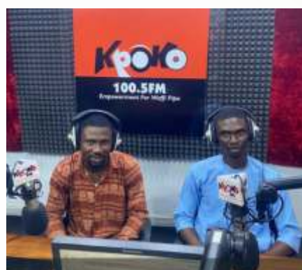
Delta ACPN World Malaria Day Radio Programme on the 25th of April, 2025