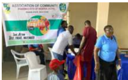
World Hepatitis Day 2024 Health Outreach organized by Woji Zone of ACPN, Rivers State Chapter. Monday, 29th July 2024 Theme: "Take Action, Treat and Vaccinate".