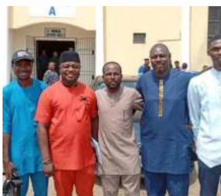
ACPN EXCO as invited Guests at the induction ceremony of DELSU Pharmacy Graduands on the 13th of March, 2025