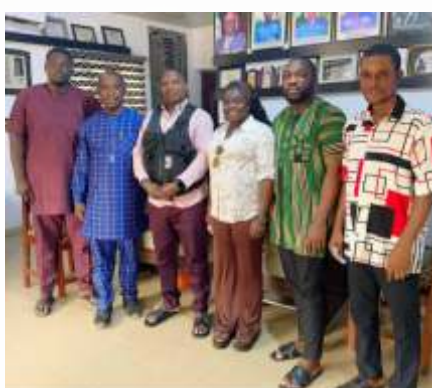
Advocacy visit to the Sapele Area Command of the Nigeria Police Force