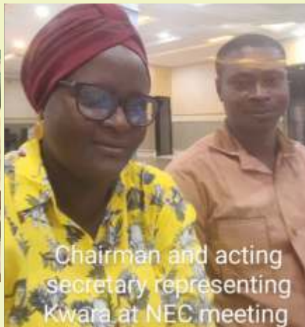
Chairman and acting secretary representing Kwara at NEC meeting