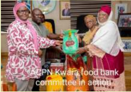
ACPN Kwara food bank committee in action