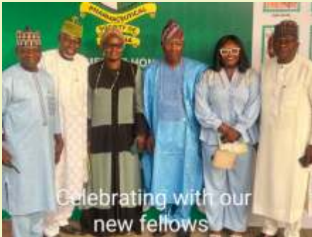
Celebrating with our new fellows