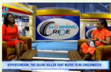
2025 World Hypertension Day Programme on DBS Morning ride, Asaba