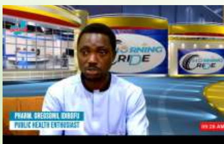
World Malaria Day Celebration at DBS, Asaba