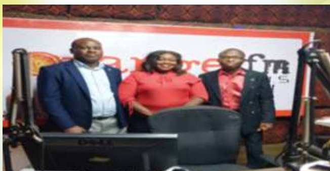
RADIO PROGRAM ORGANIZED BY ONDO ACPN TO MARK 2025 WORLD MALARIA DAY