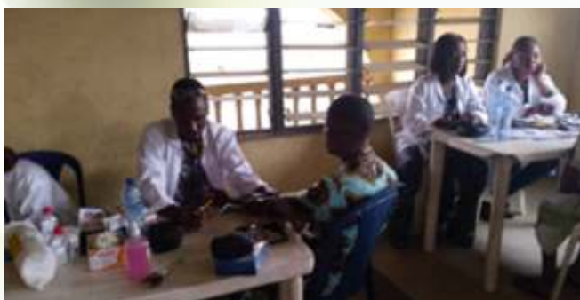
MEDICAL OUTREACH ORGANIZED BY ONDO ACPN TO MARK 2025 WORLD MALARIA DAY