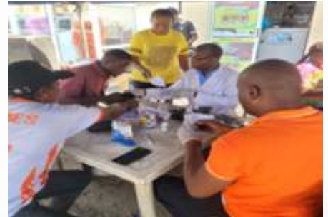
MEDICAL OUTREACH ORGANIZED BY ONDO ACPN TO MARK 2024 WORLD DIABETES DAY IN AKURE