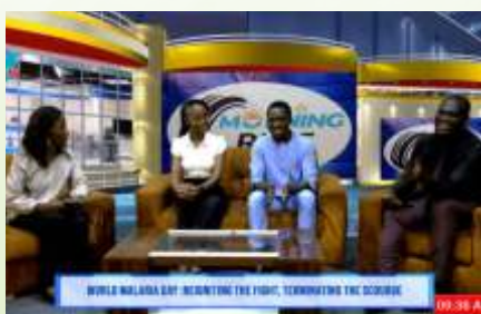
World Malaria Day Celebration at DBS TV on the 25th of April, 2025