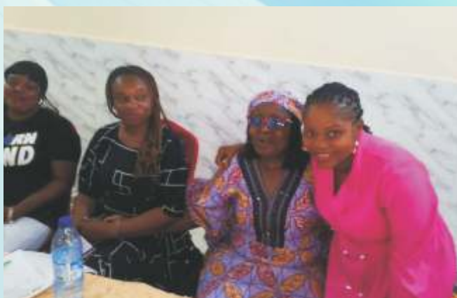
The Chairman & EXCOS at Business Submit 2025