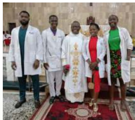
World Hypertension Day Church Outreach in Ughelli, Delta State.