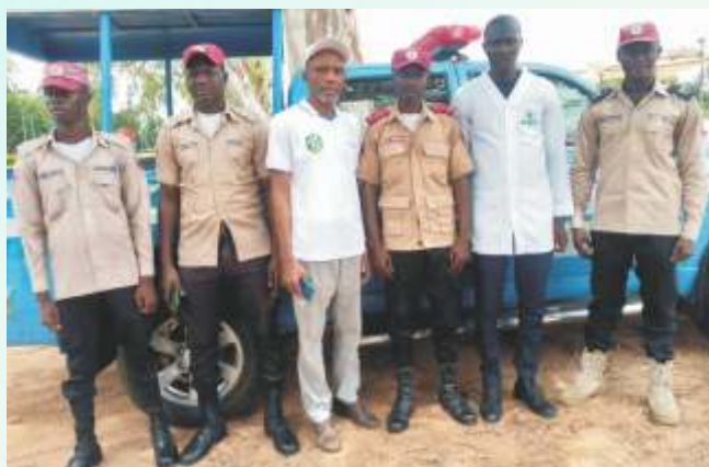
World Pharmacist Day 2024 road walk with FRSC