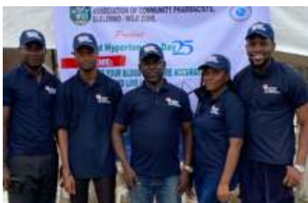
World Hypertension Day 2025 Health Outreach organized by Elenwo and Woji Zones of ACPN, Rivers State Chapter. 19th May 2025 Theme: "Measure your Blood Pressure Accurately, Control it and Live Longer".