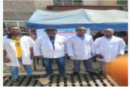
MEDICAL OUTREACH ORGANIZED BY ONDO ACPN TO MARK 2025 WORLD MALARIA DAY