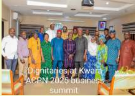
Dignitaries at Kwara ACPN 2025 business summit