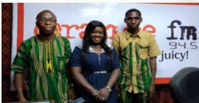
RADIO PROGRAM TO MARK WORLD HYPERTENSION DAY