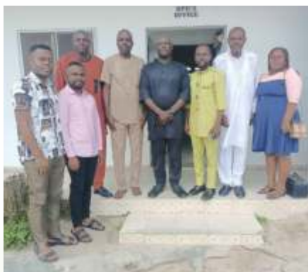
Courtesy Visit to the DPO of Ekpan Police Division, Delta State