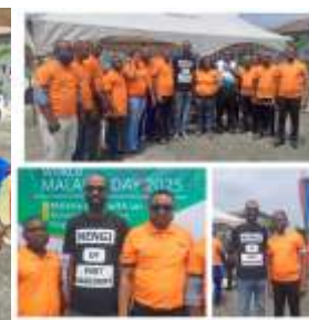
World Malaria Day 2025 Health Outreach organized by Rumuomasi and Rumuola/Rumuokwuta Zones of ACPN, Rivers State Chapter. Monday, 28th April 2025

Theme: "Malaria Ends with us, Reinvest, Reimagine, Reignite".