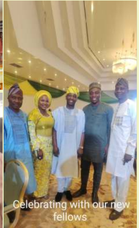
Celebrating with our new fellows