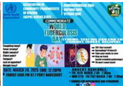
World Tuberculosis Day 2025 Radio Outreach at Family Love FM 97.7 FM Port Harcourt organized by Rumuokwuru, Okporo, and Oyigbo Zones of ACPN, Rivers State Chapter. 24th March 2025

Theme: "Yes! We can end TB: Commit, Invest, Deliver".