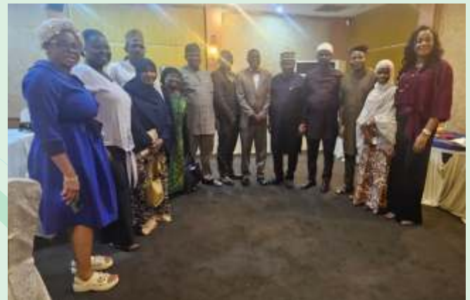
ADVOCACY AND COLLABORATION ON NATIONAL PRESCRIPTION POLICY